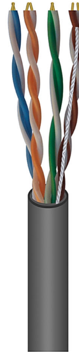
CAT-5E UTP CABLE