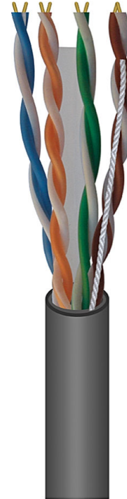
CAT-6 UTP CABLE