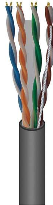
CAT-6 U-UTP CABLE